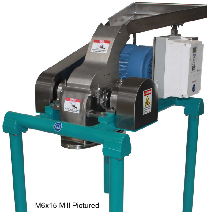
M6x15 Mill Pictured